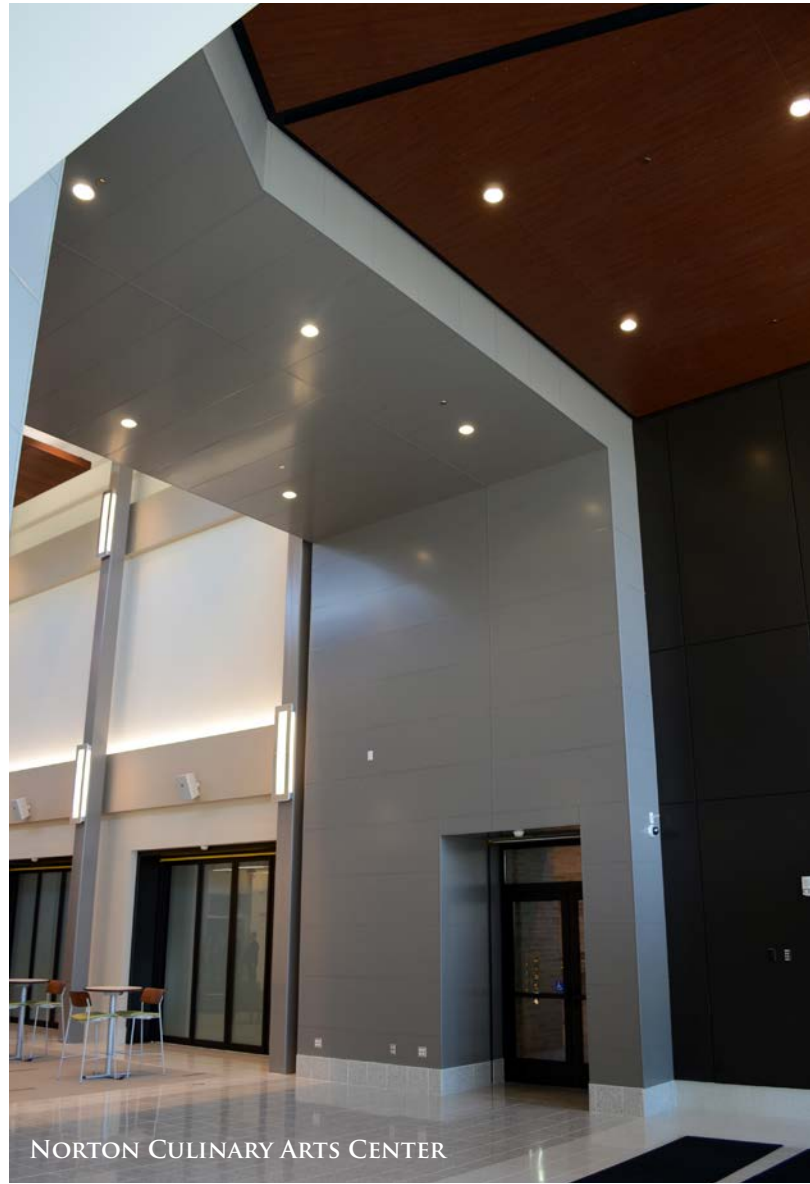
NORTON CULINARY ARTS CENTER

Environmentally responsible, panels are available with Forest Stewardship Council® certification. Furthering our commitment to sustainability, energy used in production is sourced from in-house scrap materials.