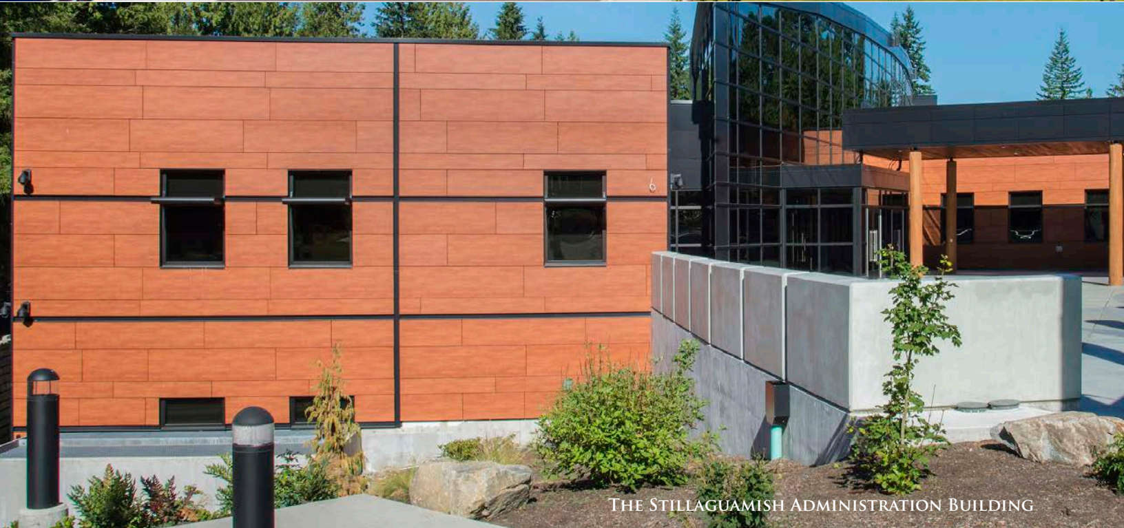
THE STILLAGUAMISH ADMINISTRATION BUILDING