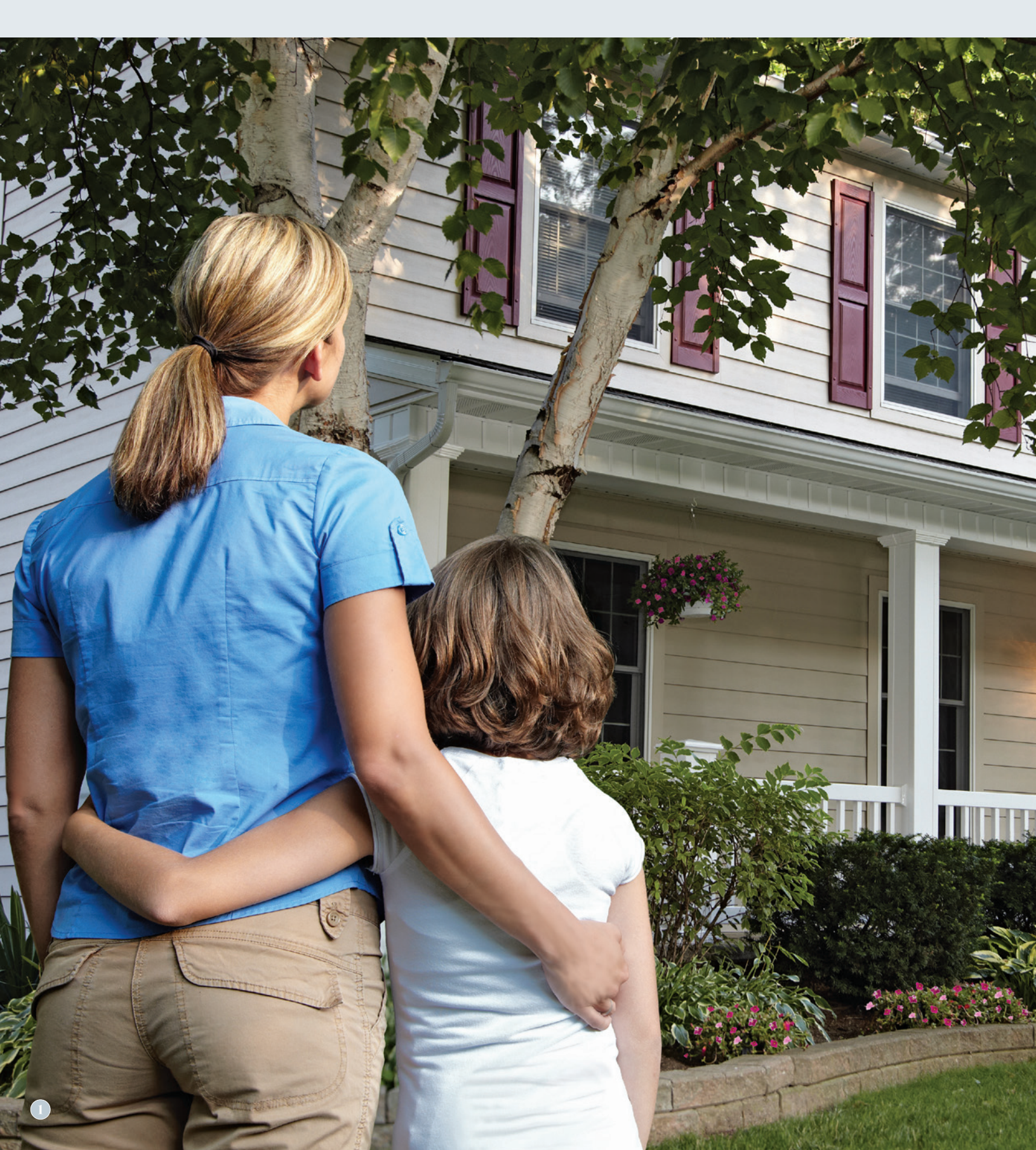
Straight lines. Subtle textures. Bold Performance. Welcome home to Everlast.