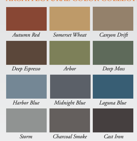
Note: Colors are as accurate as printing techniques allow. Make final color selections using actual product samples. All colors may not be available in all markets.

When it comes to designing your home, personal taste is everything. Visit alside.com and click on Design Showcase to bring your inspirations to life.